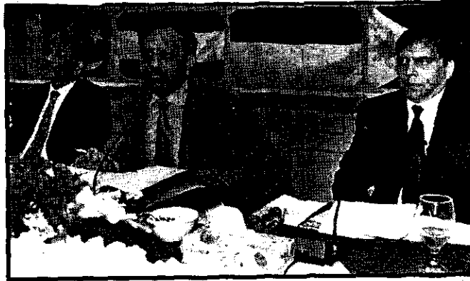
اسلام آباد: چیئر مین بی ٹی اے شہزادہ عالم لوکل ہوٹل میں منعقدہ ورکشاپ سے خطاب کر رہے ہیں۔

جلد 12 جمعہ المبارک 15 جون 2007ء 1428ھ 29 جمادی الاول تبت 3 روپے نمبر 328