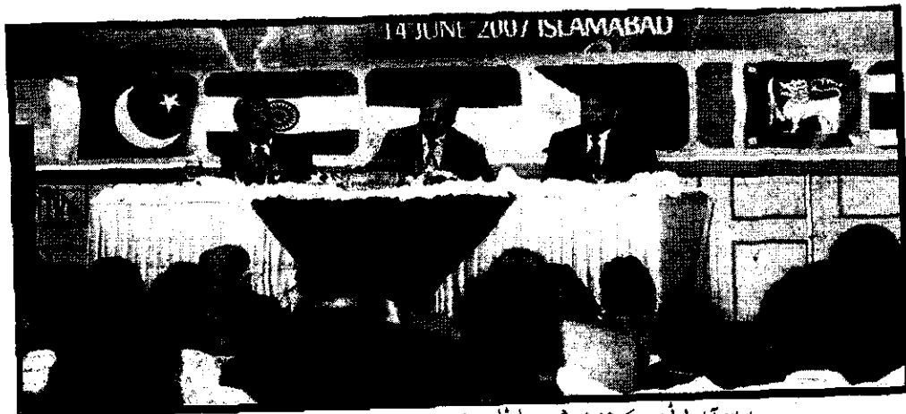
اسلام آباد، جی ٹی اے کے چیئرمین جنرل اوہ عالم نیلی کام کے حوالے سے مشفقہ سیمینار سے خطاب کر رہے ہیں