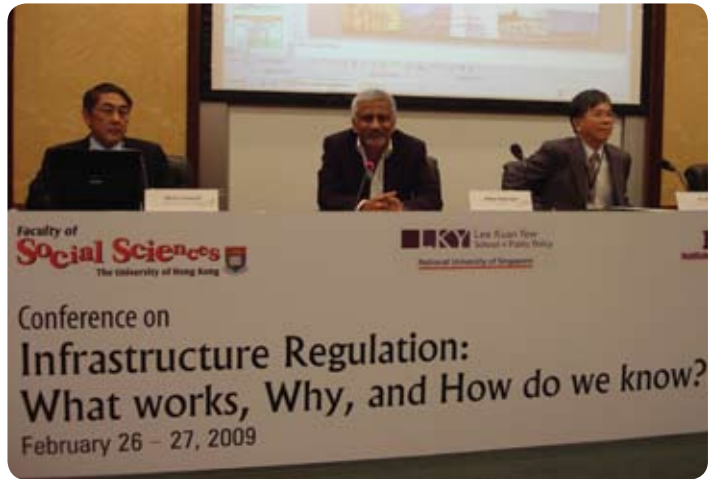
Panel at conference co-organized with the University of Hong Kong and the Lee Kuan Yew School of Public Policy at the National University of Singapore

LIRNEasia's philosophy on partnerships includes two key guidelines. Firstly that all partnerships should be directed towards LIRNEasia's medium and long-term strategic direction; and secondly that partnerships should be pursued with parties where the partner complements LIRNEasia's competencies, filling a gap that LIRNEasia by itself cannot. LIRNEasia's strongest relationship, with Sarvodaya, Sri Lanka's largest community-based organization, exemplifies this. Starting with the dam safety project in 2005, Sarvodaya has contributed to LIRNEasia's research efforts through its presence in 15,000 Sri Lankan villages. These include the HazInfo project (2006-08) and the Real-Time Bio-surveillance project (2008-10). Sarvodaya's Executive Director has served on the LIRNEasia board from inception and LIRNEasia's CEO serves as advisor to Sarvodaya. The design of LIRNEasia's expression of interest for the Think Tank funding from the Gates and Hewlett Foundations managed by IDRC is based on the depth and strength of this five-year collaboration. In this manner, over the past five years, LIRNEasia has developed partnerships with over 40 organizations.