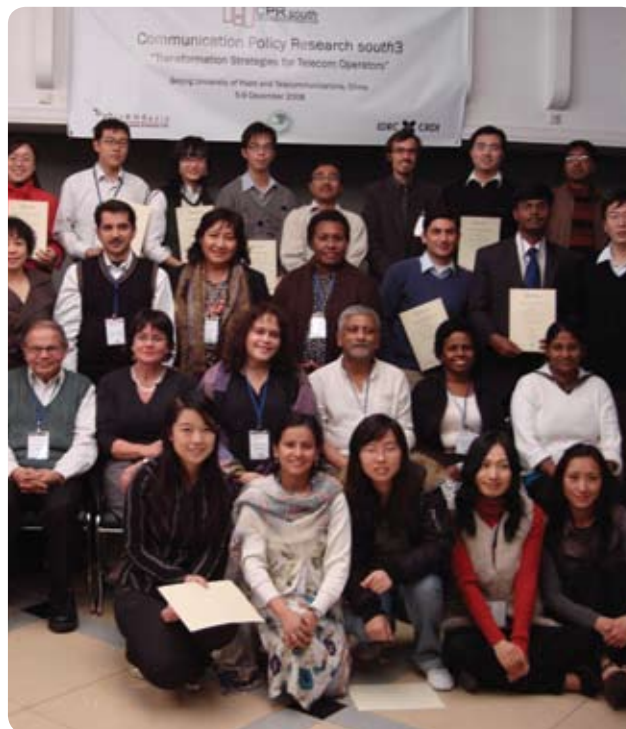
CPRsouth3 Young Scholars, 5-9 December 2008, Beijing, China

Relationships have been developed with the private sector, through interactions with industry associations (GSM Association, Cellular Operators' Association of India, Indonesia's MASTEL, etc) as well