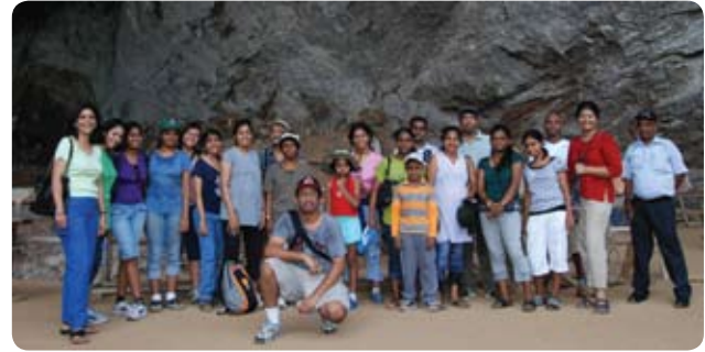
LIRNEasia Annual Trip 2009, Pahiyangala, Sri Lanka

Given that we seek to develop subject expertise and have the objective of having the world think of our senior staff as specialists on specific subjects, research managers have their subject expertise reflected in a second half of their titles (e.g., Senior Research Manager and Broadband Specialist). Though they do not come to work every day, LIRNEasia's dynamic group of research and policy fellows, from Bangladesh, India, Indonesia, Pakistan, the Philippines, Sri Lanka and Thailand are team members in the fullest sense. All planning meetings as well as our annual trip includes at least one researcher who does not live in Sri Lanka. This setup, a solution to LIRNEasia's geographically-dispersed human resource pool, has been effective in working across multiple South and Southeast Asian countries.