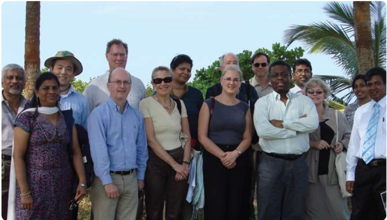
LIRNEasia researchers with visiting members of the IDRC Board of Governors and staff near the Kalu River estuary, Sri Lanka, January 2009

ICT Agency of Sri Lanka, infoDev (World Bank), the United States Agency for International Development and the Institute for Money, Technology and Financial Inclusion of the University of California at Irvine. A CSR contribution from Hayleys Industrial Solutions triggered a series of events that led to the design and implementation of the affiliate project, K2I.